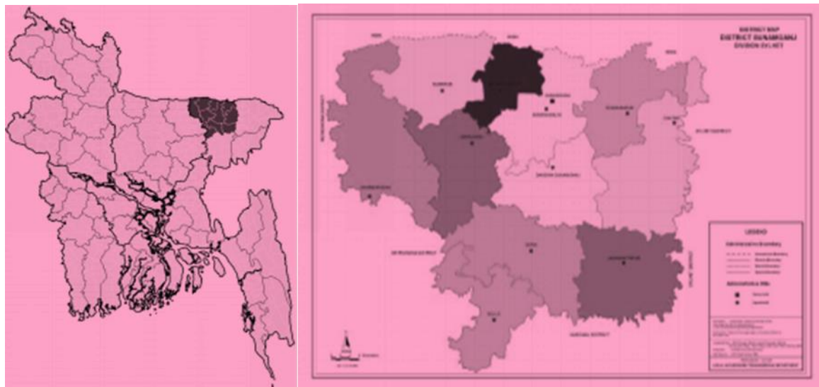
Figure 1: Location of Sunamganj district on the map of Bangladesh.

indicates the diversified culturally induced norms and values practiced in these research sites. The respondents were approached through the local village high schools and the teachers. So the literacy rate and education were the base of selecting the research sites. Also, local guardians and teachers were interviewed from each research site. Besides, the local Shurjer Hashi Clinic, National Children Task Force Bangladesh (NCTFBD), and the Family Planning program of the three Upazilas have been chosen to understand the role they play in local unmarried female adolescents' sex education and contraceptive knowledge.