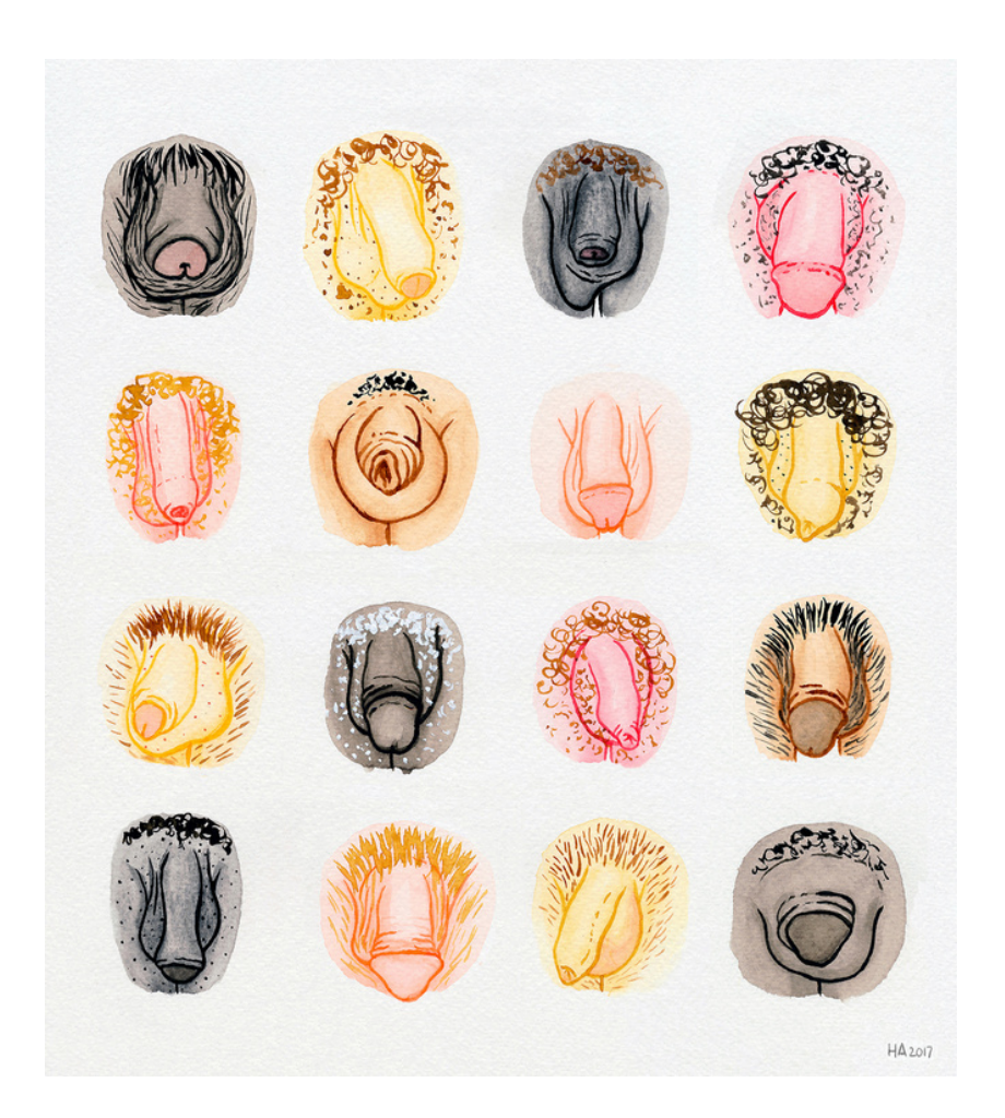
Image titled "Penis Gallery" depicts diverse penises and was illustrated by Hilde Atalanta and published in Het Parool