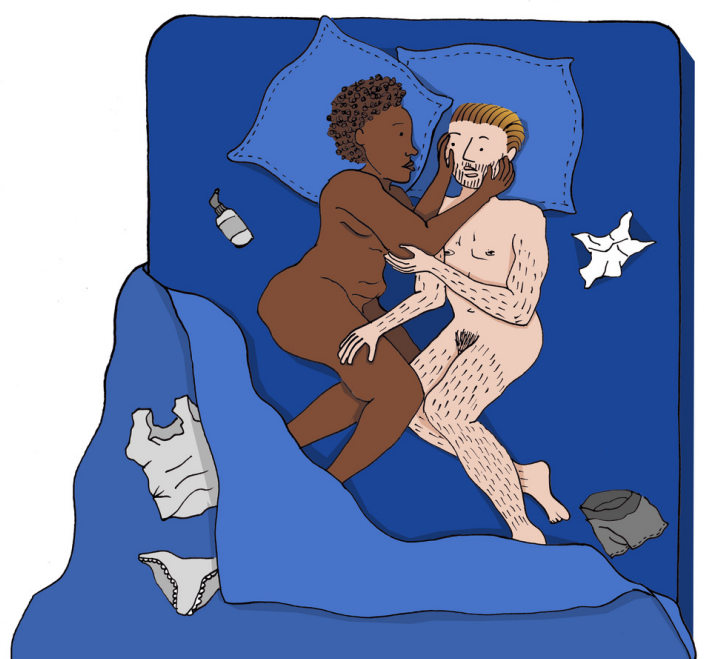
Image depicts post-sex cuddling and was illustrated by <u>Alexandra Maignan</u> for Share-Net Netherlands

Image depicts oral sex and was illustrated by <u>Afroditi</u> <u>Papadopoulou</u> for Share-Net Netherlands