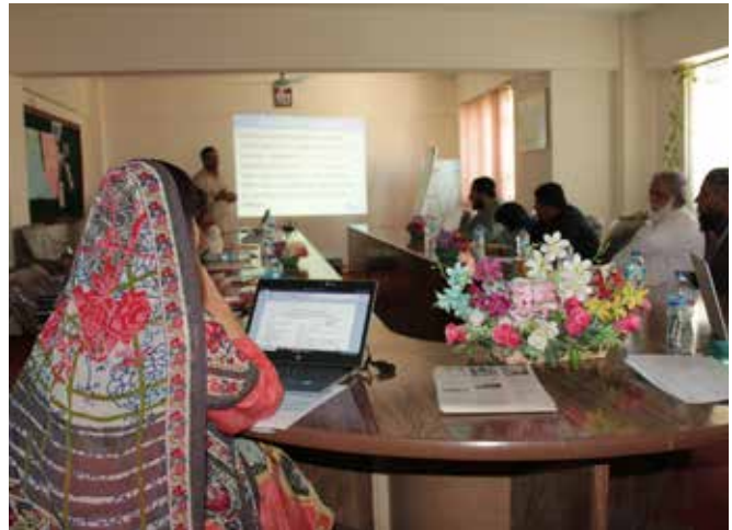
OPD mapping workshop in Pakistan

Working with OPDs helped service providers realise the gaps in service provision for persons with disabilities and to understand the important role of OPDs in engaging persons with disabilities. The mapping process was important to understand capacities and experience. IPPF reflected that working with OPDs was an important change in their way of working, facilitated by HI support and networks. They plan to continue working with OPDs using the MoUs and relationships established during WISH2ACTION.