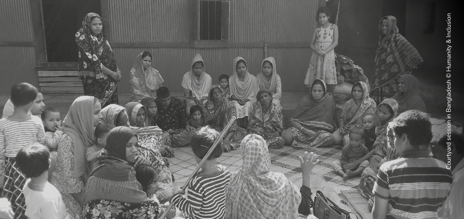
Courtyard session in Bangladesh