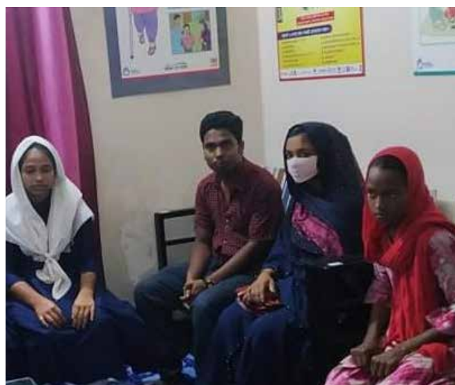
Family welfare corner in Bangladesh