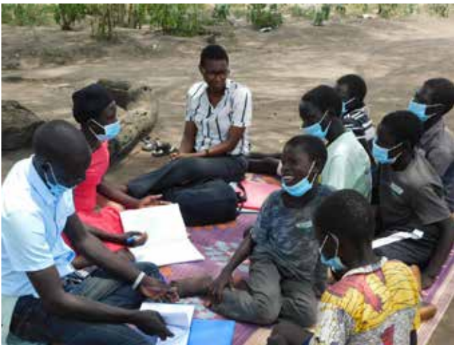
Focus group discussion with young boys with disabilities in Uganda, © Humanity & Inclusion