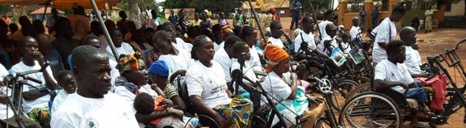
Persons with disabilities attend an event in South Sudan