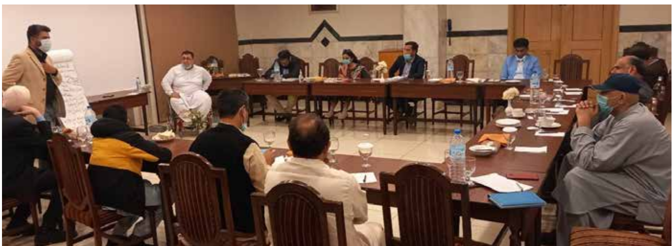
Meeting of inclusion committee in Karachi, Pakistan