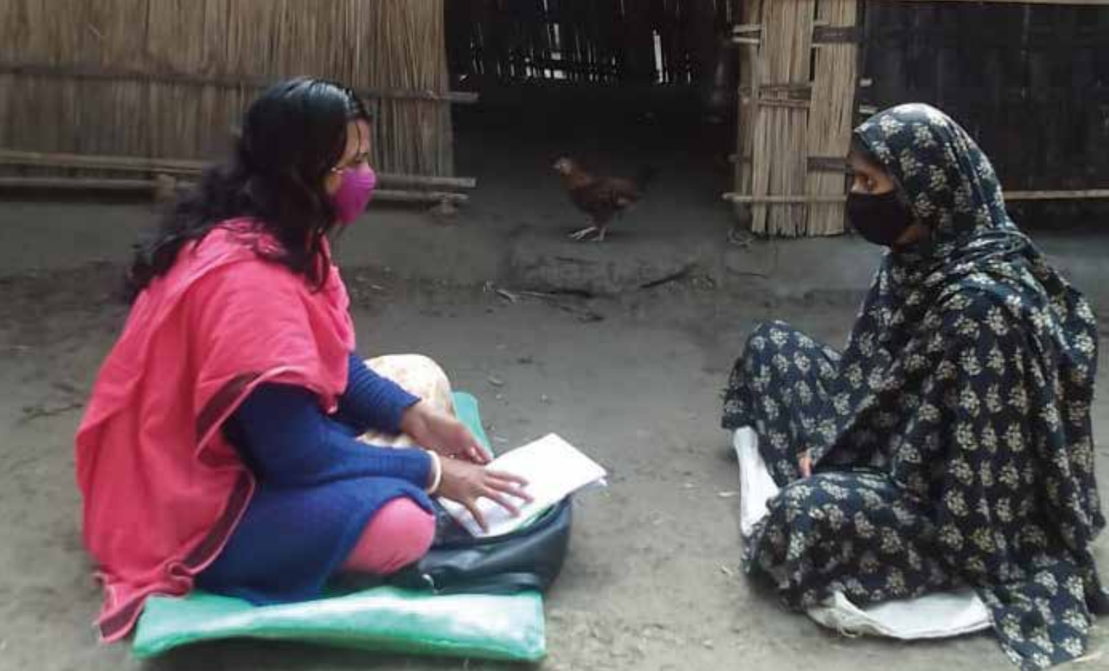
One to one discussion in Bangladesh