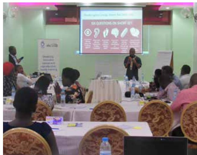
Training on the WG-SS in Uganda