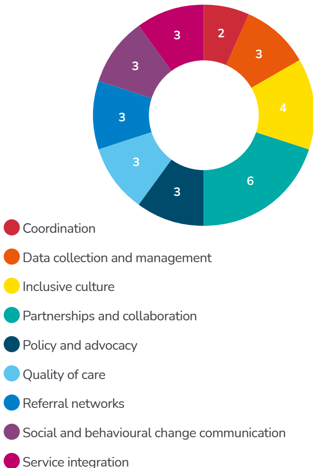
Figure 1: Distribution of good practices and lessons learnt across themes

Figure 1 shows the distribution of good practices and lessons learnt across the nine themes, identifying particularly strong learning in the areas of inclusive culture and partnership and collaboration.