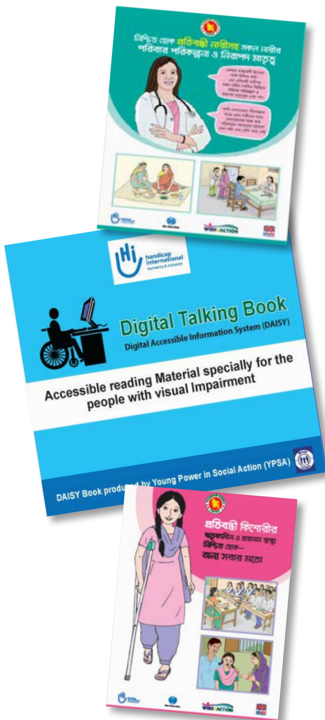
SBCC materials produced during WISH2ACTION, © Humanity & Inclusion

The Bangladesh team developed inclusive leaflets, flipcharts, and brochures on SRH topics for community courtyard sessions – they were inclusive because the format was designed to meet the needs of persons with different impairments. In Bangladesh, HI is also developing digital materials which use Braille to support people with visual impairments. Table 1 shares some findings from HI about which formats are effective for people with different impairments.