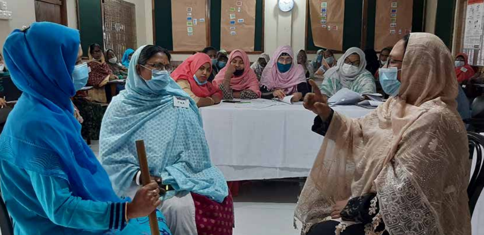
Family planning service providers undertake a role play activity during training