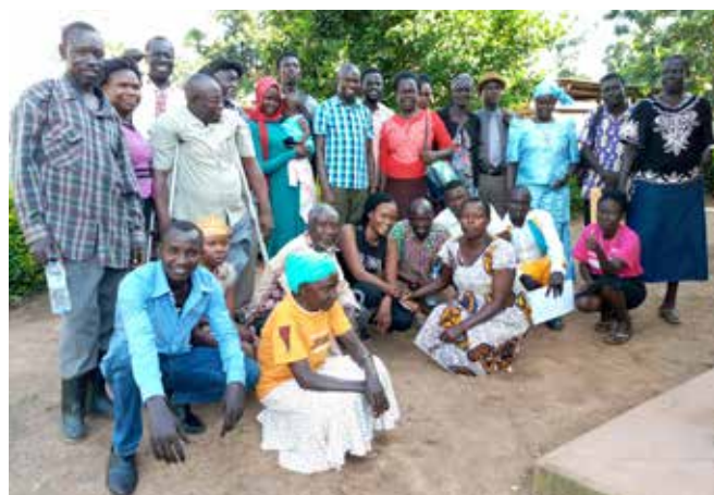
Working in partnership in South Sudan, © Humanity & Inclusion