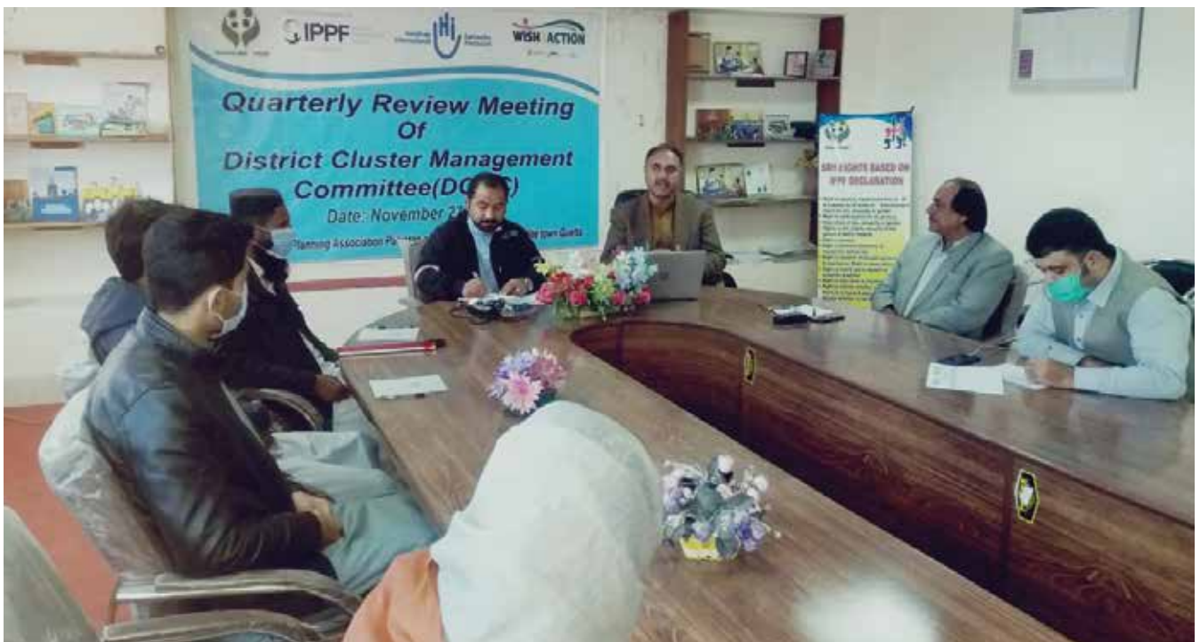
District cluster management committee meeting in Pakistan, © Shuja, Humanity & Inclusion