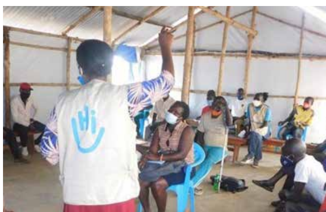
Project manager talking to participants on the challenges of referrals for persons with disabilities in Bidi Bidi Refugee settlement camp, Yumbe District, Uganda