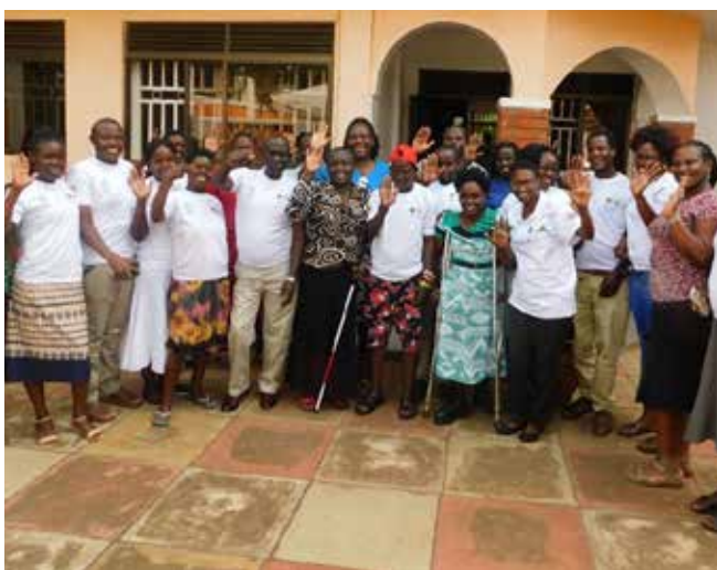
Health workers and OPD members from Mbale district, Uganda after attending a disability inclusive training.

HI teams found that learning happened because of the mixed group and that having persons with disabilities present helped service providers realise that persons with disabilities have SRH needs just as persons without disabilities do. It also improved their confidence through experience interacting with persons with disabilities.