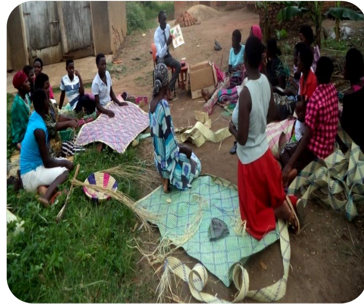
SRHR learning session with Batwegombe women's group in Bukoona Parish-Nakalama subcounty